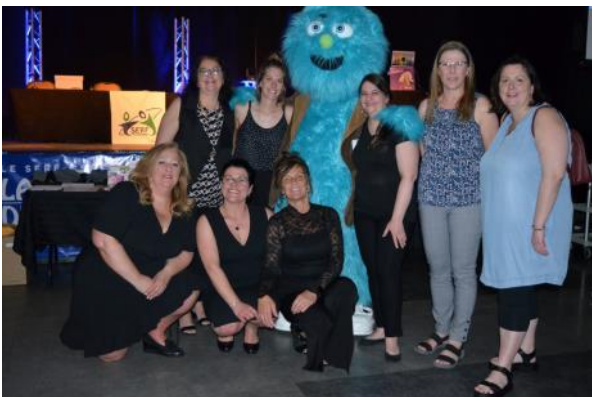
The office team SERF-CSQ