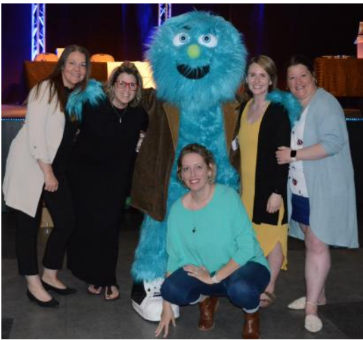
Delegation Littoral, teaching and support sectors with the ED mascot - teacher fan