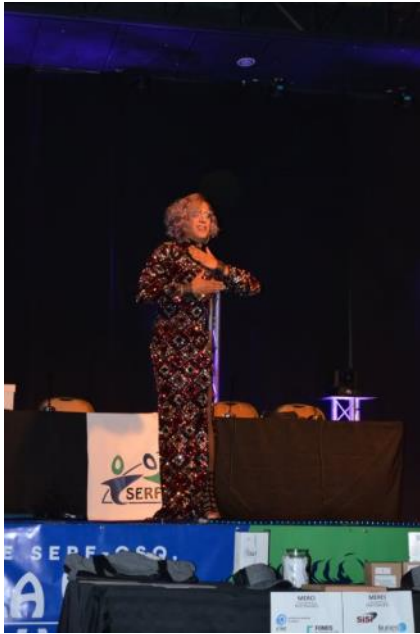
Barbada de Barbade to the animation during the social evening