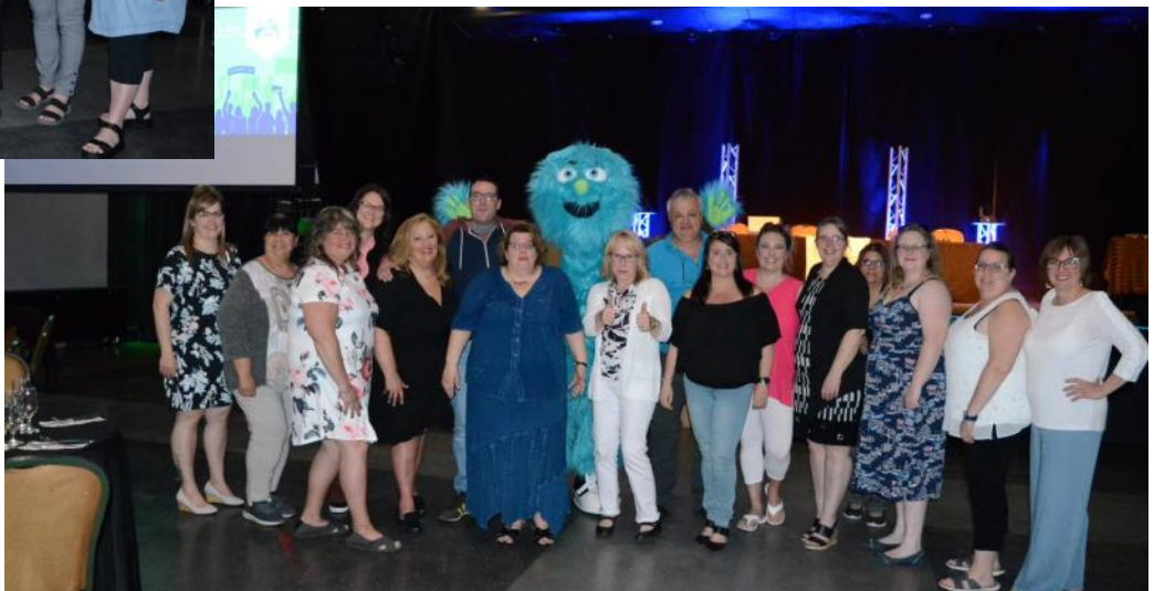
Delegation Sept-Iles, support sector