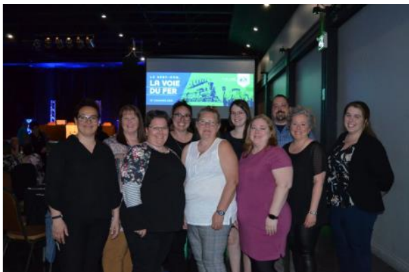
Delegation Port-Cartier, teaching and support sectors