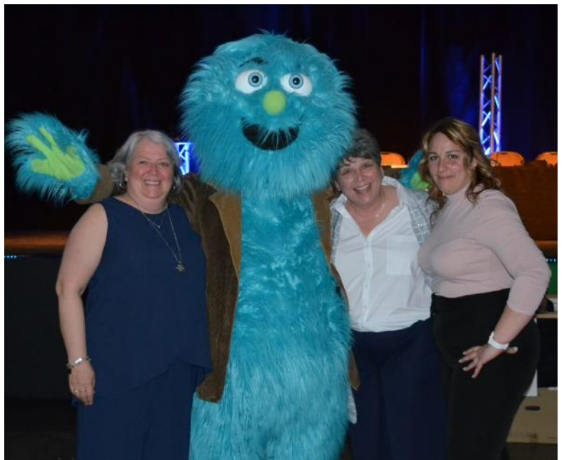
Delegation Fermont, teaching and support sectors