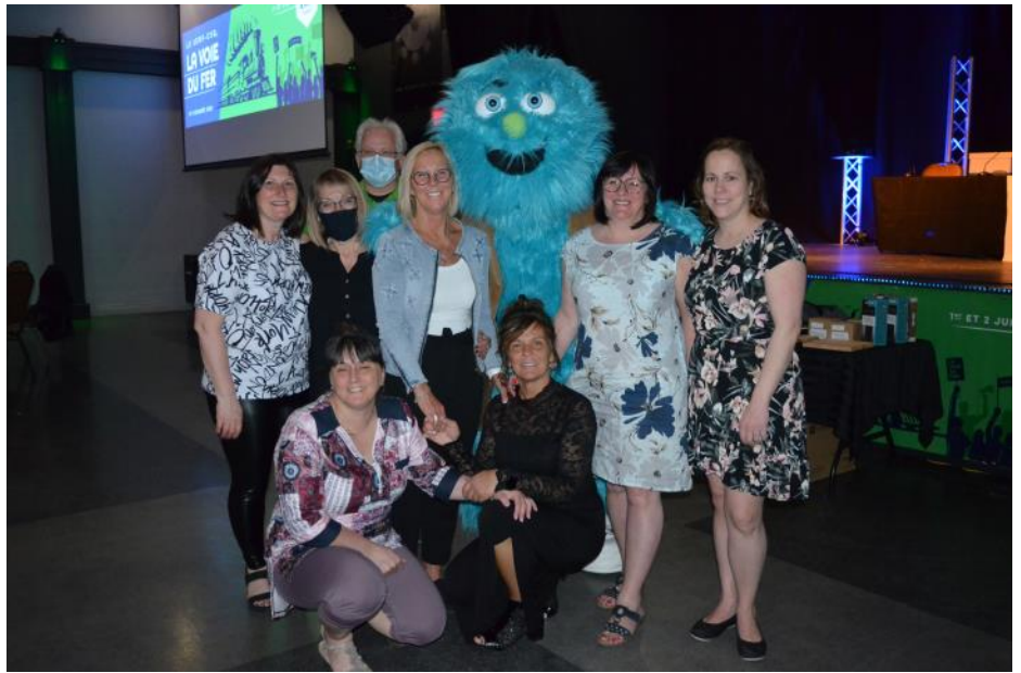
Delegations Moyenne-Côte-Nord et FGA/FP, teaching sector