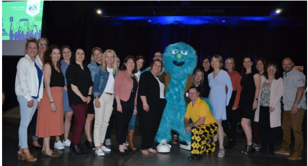
Delegation Sept-Iles, teaching sector